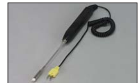
881602 surface probe